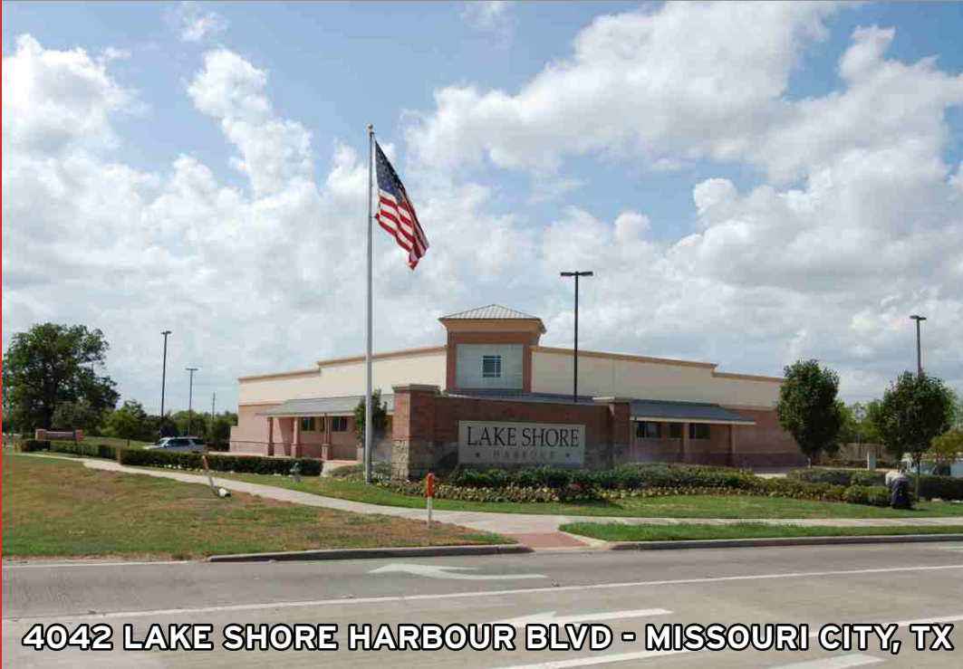
4042 LAKE SHORE HARBOUR BLVD - MISSOURI CITY, TX