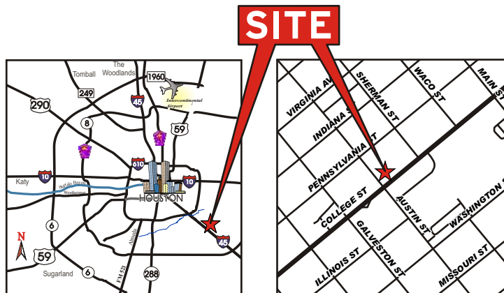
Harris Co. Key Map Pg. 571