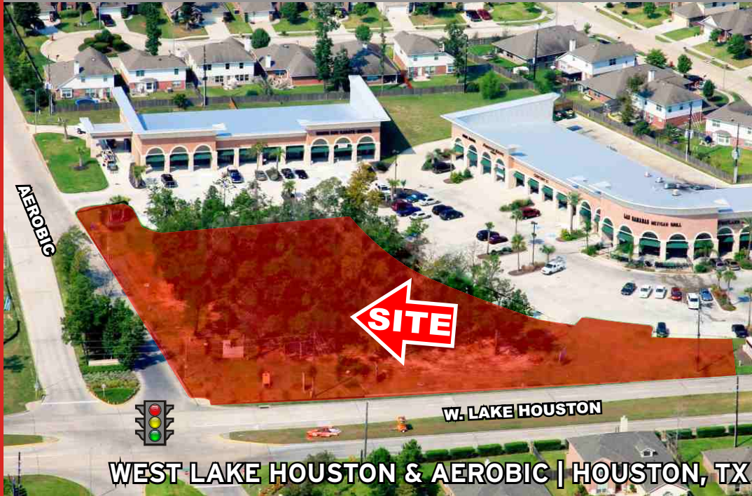
WEST LAKE HOUSTON & AEROBIC | HOUSTON, TX