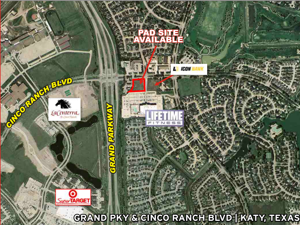
GRAND PKY & CINCO RANCH BLVD | KATY, TEXAS