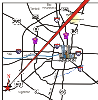
Fort Bend Co. Key Map Pg. 605